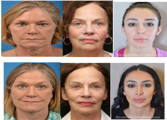
Figure1. Shows pictures of people before and after plastic surgery

whom the plastic facial surgery database is unavailable due to privacy concerns. Without access to surgery information, predicting static features (Areas without surgical effects) is very challenging. Cosmetic surgery may additionally be used for persons who attempt to conceal their identity to engage in or evade the law. The current face recognition algorithm effectively extracts a feature from an image. This procedure also makes it possible to steal freely without worrying about being recognized by a facial recognition system, which could result in the rejection of actual users. Fig. 1 shows an example of the effect of plastic surgery on facial appearance resulting from plastic surgery (before and after pictures of plastic surgery).